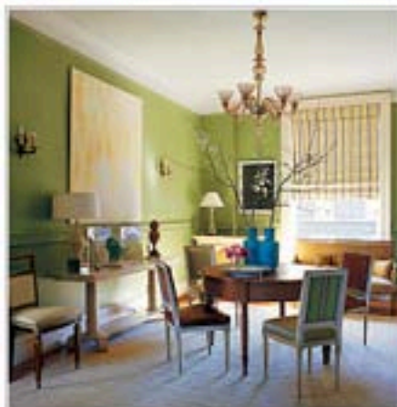
Apple green hues paired with carefully mismatched chairs are right at home in this elegant dining room, while the Venetian chandelier adds finesse.