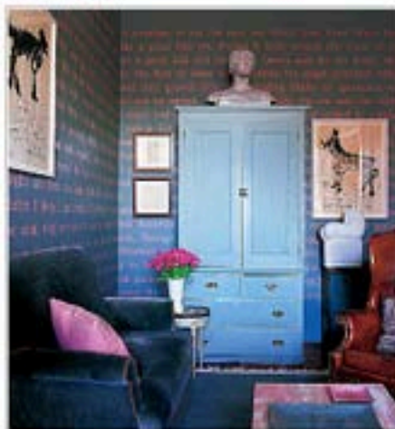
Quotes and passages from scribes like Langston Hughes, Zora Neale Hurston and Dr. Seuss provide comfort and inspiration on these painstakingly painted walls.