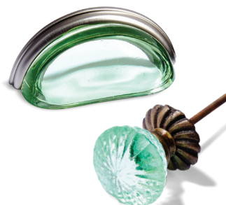
COLORFUL HARDWARE Lew's Hardware glass bin pulls, $14.31; lowes.com. Simmered glass knob, $10; anthropologie.com.

"Penny dot tile is so sweet," says Kemble. "But I only like to use it in small doses; otherwise it can look way too busy."