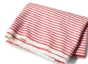
CABINET FABRIC Red ticking stripe seersucker, $9.99 per yard; moodfabrics.com.