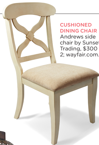
CUSHIONED DINING CHAIR Andrews side chair by Sunset Trading, $300 for 2; wayfair.com.