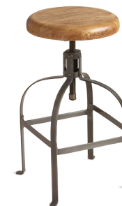
FARMHOUSE STOOL Adjustable round wood and metal stool, $120; worldmarket.com.

PAINT AND WALLPAPER Valspar Afternoon Delight 6006-10A. Bella by Arthouse in lotus teal/coral, $29 per roll; wallpaperdirect.com.