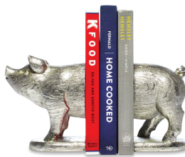
PIGGY BOOKENDS Extraordinary set of 2 resin pig bookends, $28.99; myparlorroom.com.