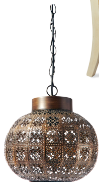
PENDANT LAMP Aged bronze pendant lamp, $130; worldmarket.com.

"I design a lot of white kitchens," says Sheila Bridges. "So when it came to my home, I wanted color and pattern. It's more fun to let your personality shine through." Pairing a gray-blue paint with a metallic patterned wallpaper opens up Bridges's apartment kitchen, and the details—a Roman shade, marble countertops (bought at Home Depot!), chrome accents—make it feel rich.