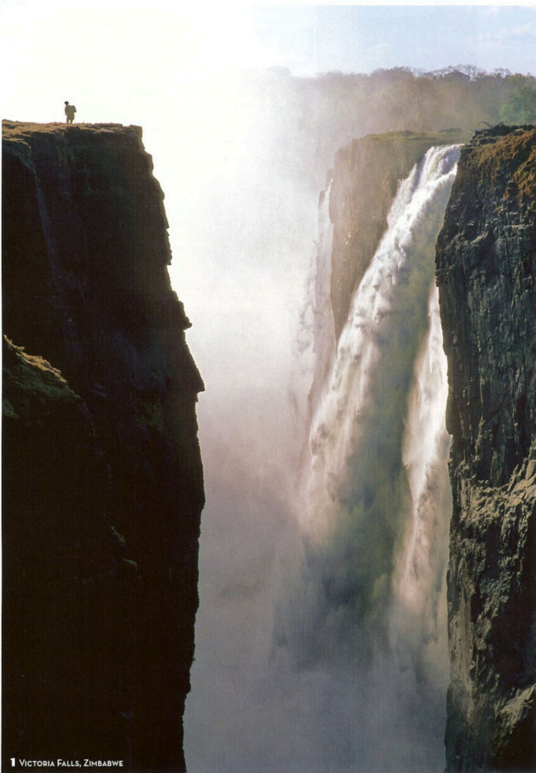
1 VICTORIA FALLS, ZIMBABWE

4 Tim Gunn Chair, fashion department at Parsons: The New School for Design; cohost of Project Runway . " SAINTE-CHAPELLE , built on the Île de la Cité in Paris in the 1240s as the private