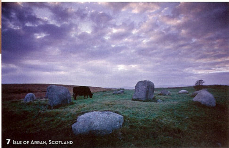
7 ISLE OF ARRAN, SCOTLAND