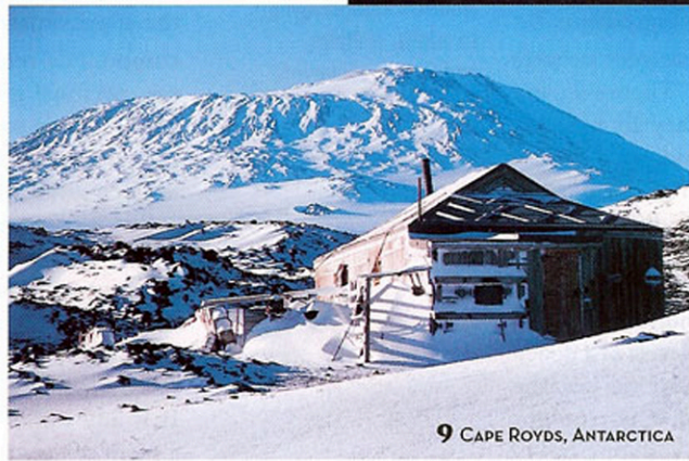
9 CAPE ROYDS, ANTARCTICA

10 David Rockwell Architect. "When I was 11, my family moved to GUADALAJARA, MEXICO, from Deal, New Jersey, and that exuberant new world ignited my interest in architecture. In the open-air markets in Guadalajara, the sunlight filtered through the stalls and transformed the entire marketplace into a magical public theater."