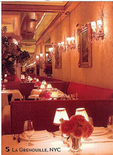
5 LA GRENOUILLE, NYC

5 Isaac Mizrahi Fashion designer. "Everyone looks great at [the Manhattan