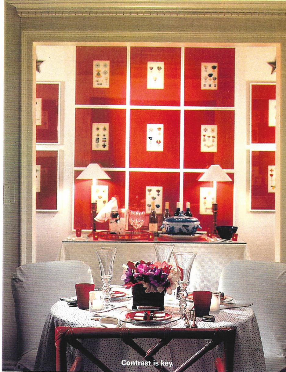
Contrast is key.