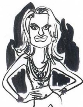
SANDRA BERNHARD host, The Sandra Bernhard Experience

Sarah , by J. T. LeRoy (Bloomsbury). "I started reading it after hearing so many amazing things about the book and about him. It's raw, genuine, and quite difficult at times. He's incredibly courageous and the world needs more people like that—especially now!"