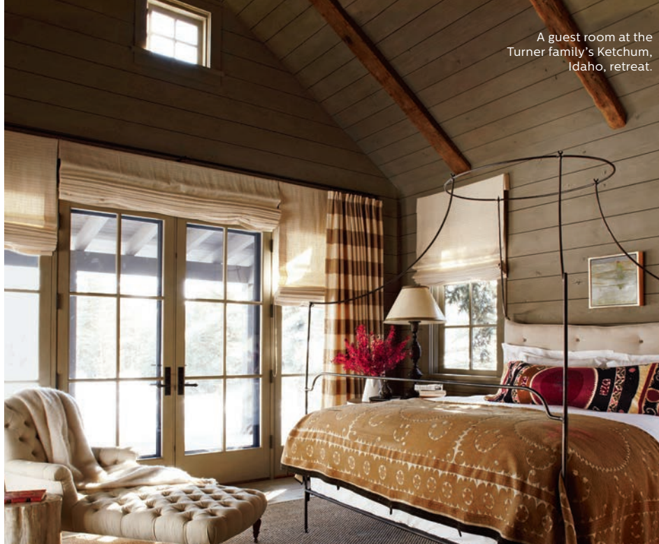
A guest room at the Turner family's Ketchum, Idaho, retreat.