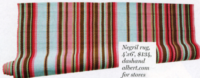
Negril rug, 4'x6', $134, dashandalbert.com for stores

• STRIPE YOUR WALLS Goodbye, blah bathroom! Search "paint stripes" on xomba.com to learn how.