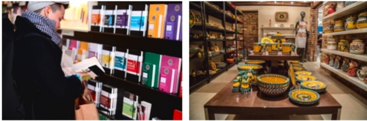
Moleskine.

→ Moleskine (3029 M St. NW) Fans of Moleskine, who include urban nomads, obsessive sketchers and diary keepers, will be heartened that a shop dedicated solely to Moleskine's designs has landed in the heart of Georgetown. This location of the Milan-based company just opened, and a remodel is planned for the spring. The Moleskine notebooks, journals, bags, travel items and reading accessories in many wonderful colors are displayed as if in a museum. Some products are made for use with digital services, including Evernote and Livescribe .