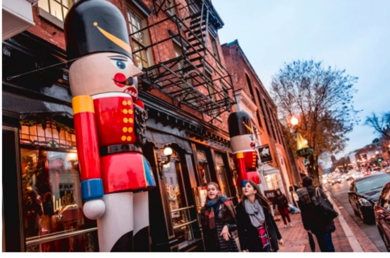
Outside Clyde's in Georgetown.