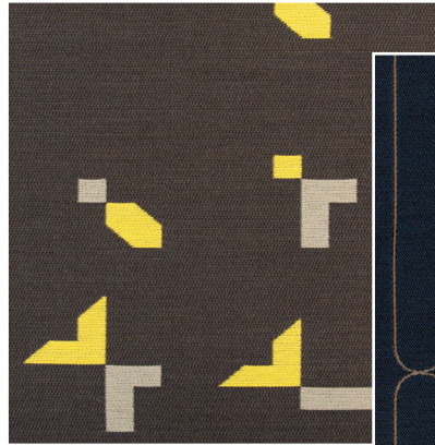
Endless in Road