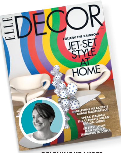
DELPHINE KRAKOFF Paris-born creator of exuberant and playful spaces. as seen on the cover of ED's May 2019 issue.