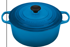
LE CREUSET Dutch oven. 400094129394. $400.