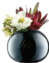
LSA Époque sapphire vase. 400013101390. $65.