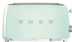
SMEG 4 Slice Toaster. 400012592812. $219.95.