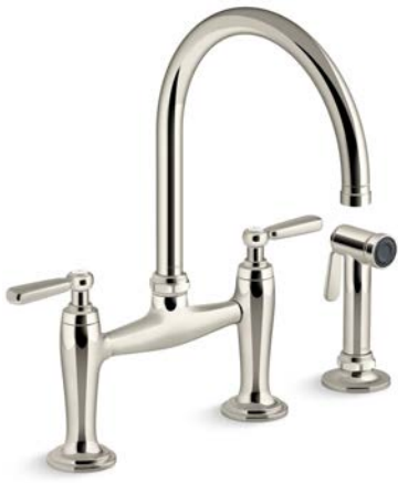
Edalyn Bridge kitchen faucet