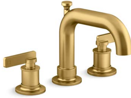
Castia bathroom faucet