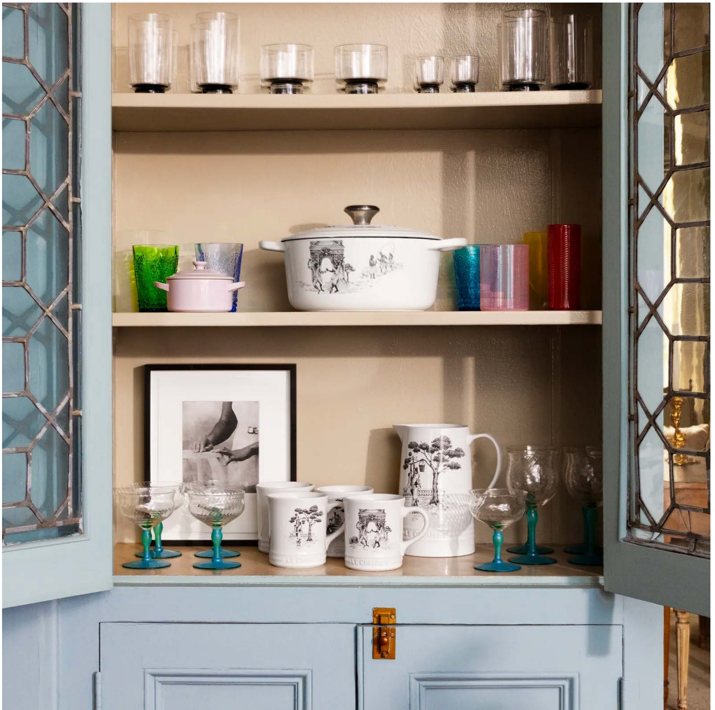
The Harlem Toile de Jouy collection, spanning Dutch ovens, pitchers, and mugs.