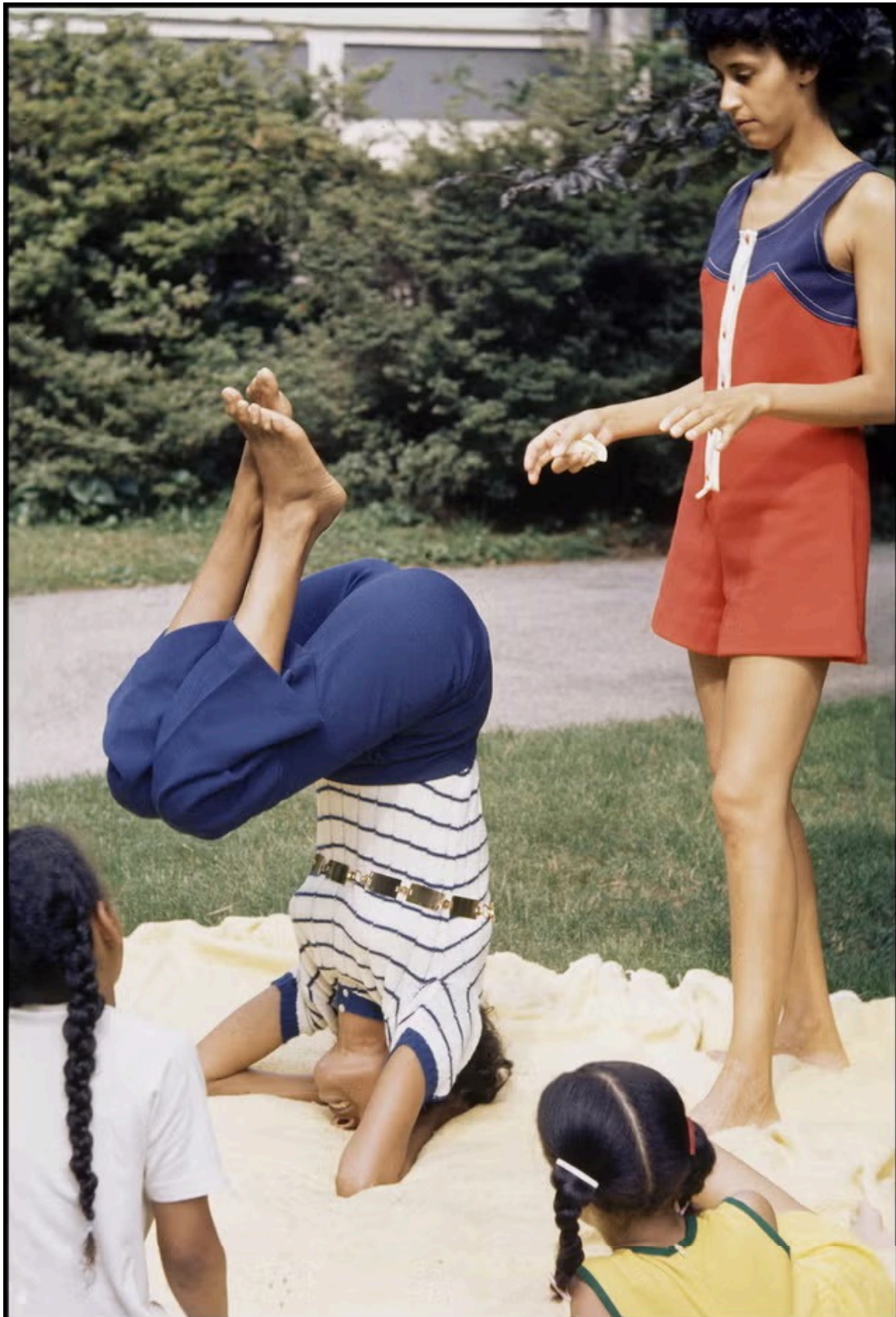
Yoga afternoons in red, white and blue